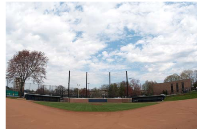
(Newly Renovated Gillespie Field )

The Moravian College Summer Prospect Camp will consist of two mutually exclusive 5-6 hour sessions. Players will have the opportunity to showcase their ability for the Moravian College Coaching Staff as well as participate in drill-work used everyday at the collegiate level.