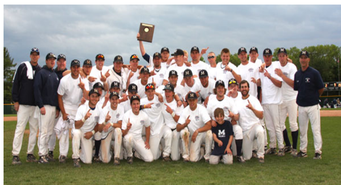
2010 Landmark Conference Champions NCAA Mid-Atlantic Regional Participant