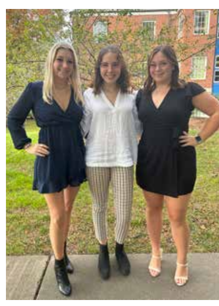
WHAT TO WEAR ON SUNDAY