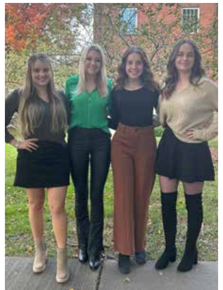
WHAT TO WEAR ON SATURDAY