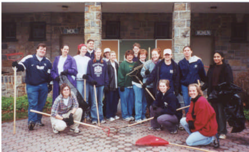
Twenty students and young alumni spent Saturday, April 7, cleaning up Sand Island. The Young Alumni Board, which sponsored the event, hopes to make this the first of an annual series of similar projects.