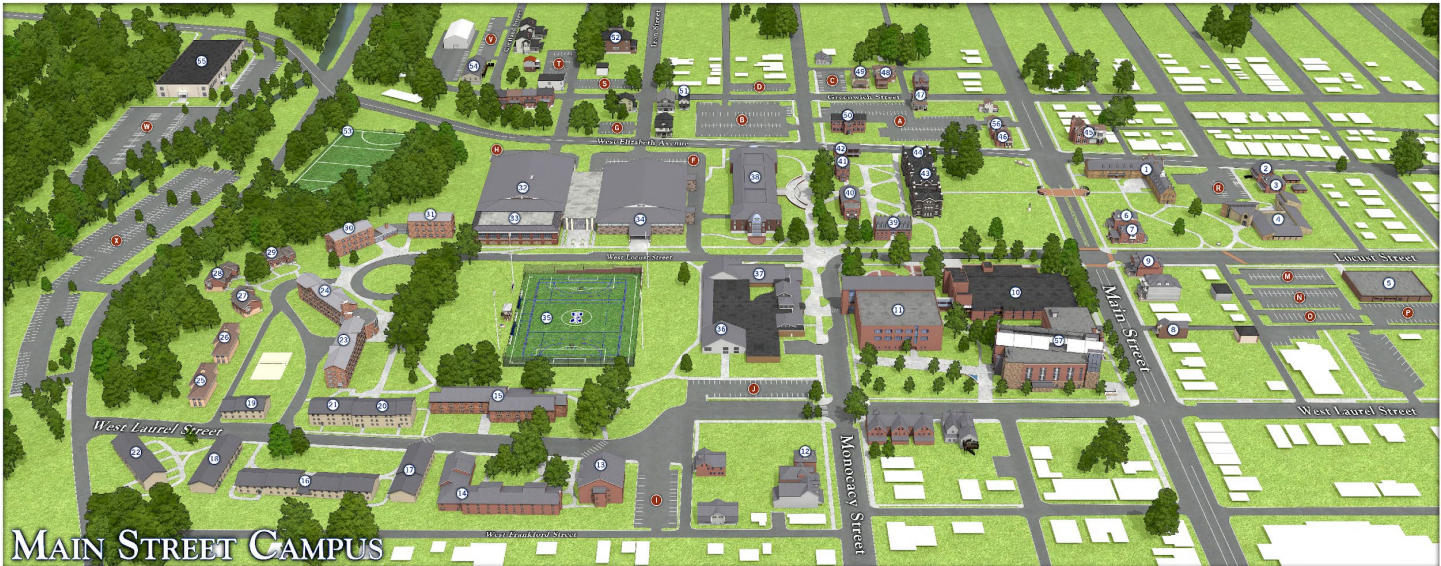
MAIN STREET CAMPUS