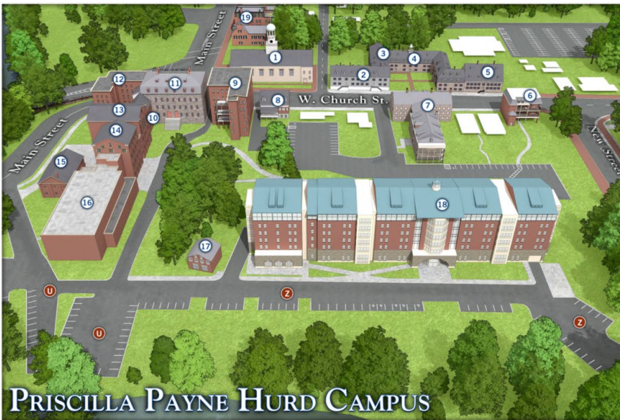
PRISCILLA PAYNE HURD CAMPUS